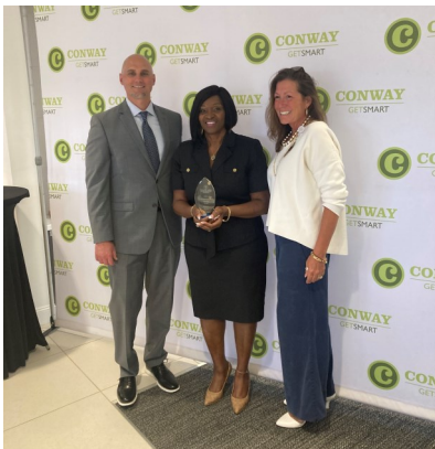
Small banquet held earlier in the week.