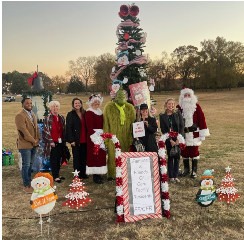
Families and Friends of Care Facility Residents (FF/CFR)