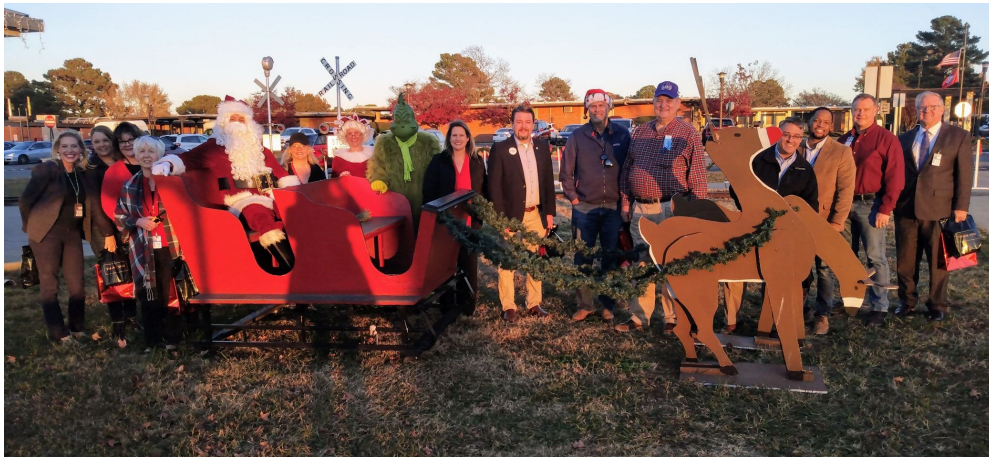
Conway's local celebrity judges