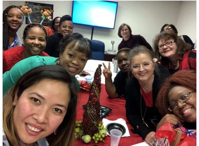
NOT the charades winning team in not the Winners Circle