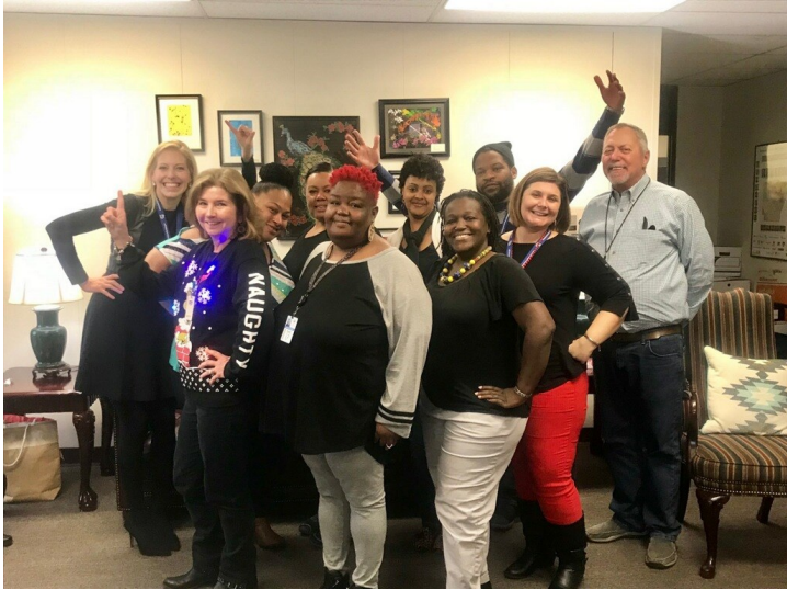
Charades winning team in DDS Director's Office Winners Circle