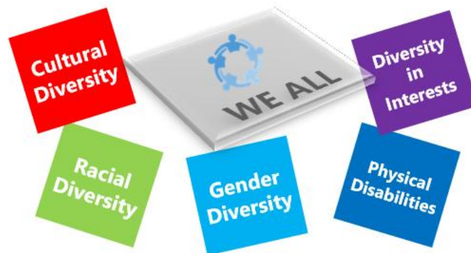
5 Major elements of our diversity programs

We have considered multiple factors to establish procedures to create a culture that's equitable and supportive, and free from discrimination and workplace harassment for every employee. Our established procedures focuses on five (5) elements of diversity areas that brings diverse viewpoints and perspectives to the company, helping us deliver finest services to our customers.